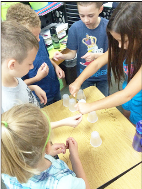
Students explored how to use teamwork and leadership, to name a few.

Each Wednesday morning, Velma Matson students participate in W.I.N. time, or “What I Need”, to support and enrich what they are learning both academically and behaviorally. For the first five sessions of W.I.N. time, students at all grade levels, 2nd – 4th grade, participated in various activities to practice important Positive Behavior expectations that complement our school’s message to R.O.A.R. with pride in the classroom, on the playground, in the cafeteria, and other areas of the school. Students participated in to apply what it means to Respect Others, fun and successful for all!