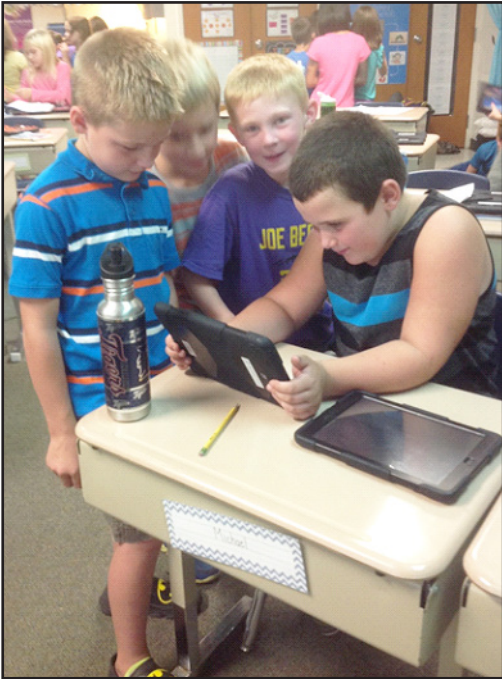
Third graders created commercials to advertise how a Newaygo Lion R.O.A.R.S. with pride at Velma Matson when we Respect Others, Act Responsibly and Safely.