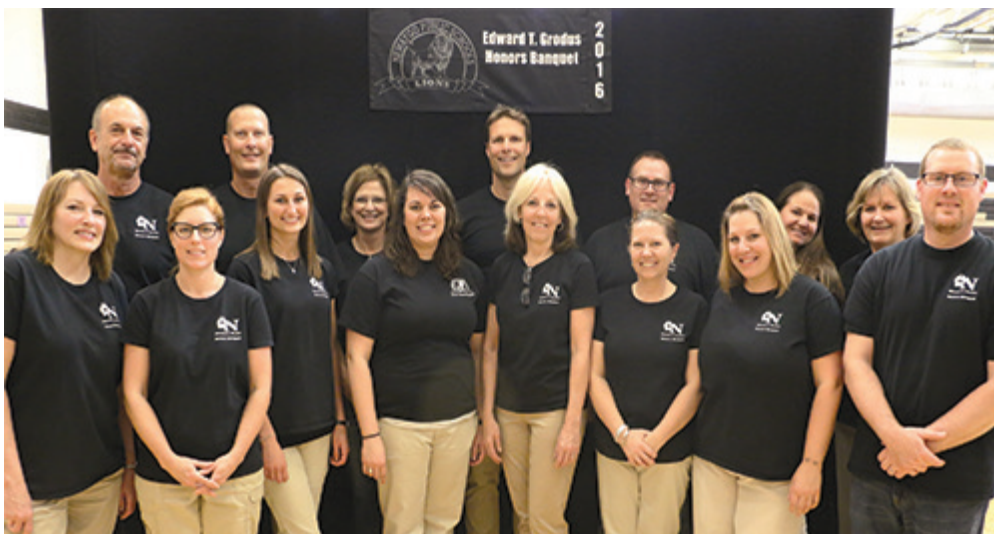
A HUGE thank you to the 'Coffee Crew'!