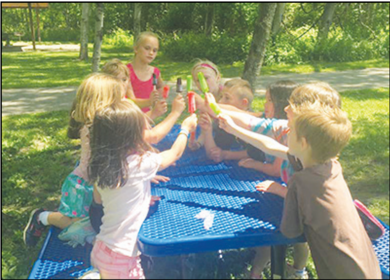
Cheers to knowledge! Learning about community and visiting Newaygo's parks deserves a refreshing snack.