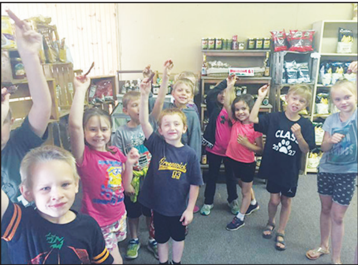
Jerkies Jerky Factory was another place we learned about our social studies curriculum. We were able to see that we are definitely consumers!