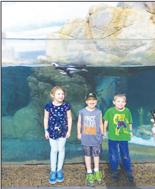
Chilling with the penguins!

The first grade once again had a successful field trip to the John Ball Zoo. Students braved tigers, and hung out with the penguins for a fun filled day! Items such as structure and function, patterns of animal behavior, and similarities between parents and their offspring were reviewed in this fun filled trip.