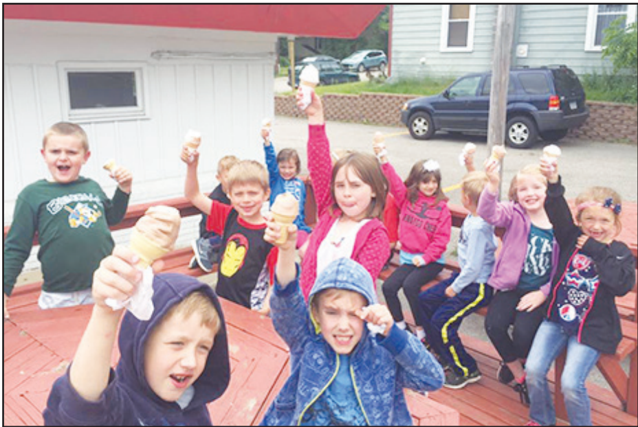
Who knew learning about goods and services could be so tasty. Raise your hand if you enjoy learning!

Learning Social Studies Fist Hand First grade students wrapped up the year with a walking field trip to visit various establishments downtown. After learning about community, goods and services, consumers and producers, and civic responsibilities throughout the year, they were able to wrap things up with an awesome hands on experience!