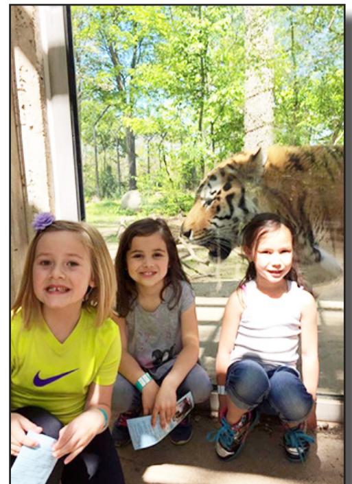
Look out behind you! The John Ball field trip was a rip roaring great time!