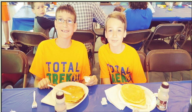
A complimentary pancake breakfast after the race? Don't mind if I do!!!