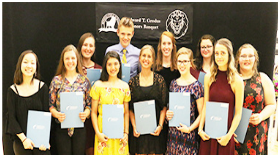
Fremont Area Community Foundation Scholarships