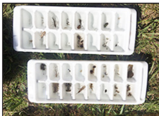
Collection of life from the White River