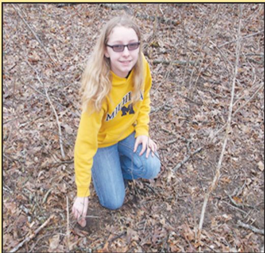
Dispersing the Native Seedballs