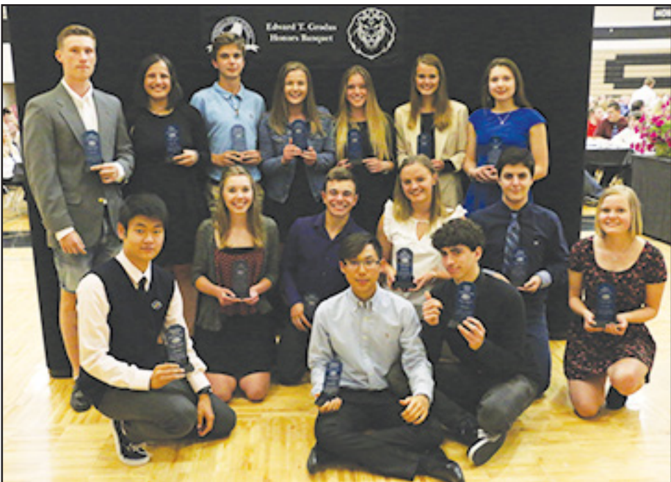
2017 Exchange Students