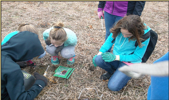
Students doing soil testing on soil temperature, light, and Ph.