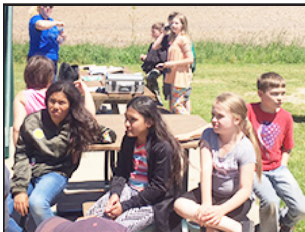
Students preparing to enter the observatory