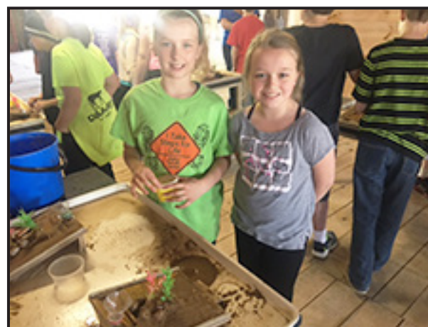
Students creating water shed models

If you are interested in visiting the Observatory and/or farm you may call them at (231) 924-2060 ext. 101, or email them at www.KropscottFarm.org and www.sfwobservatory.org .