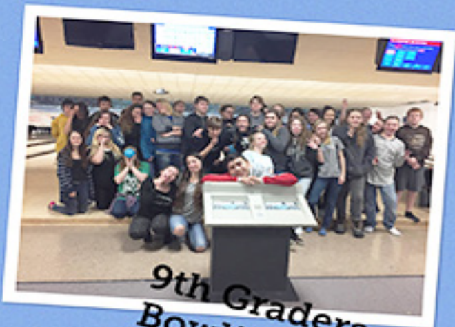
9th Graders Bowling Incentive