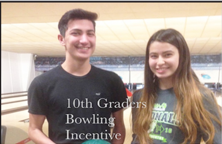
10th Graders Bowling Incentive

41 Freshmen earned the PBIS Bowling Incentive by missing 2 or less days of school and having 2 or less tardies.