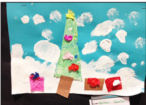
#2 - Tree by Kolten Vawter, 1st grade